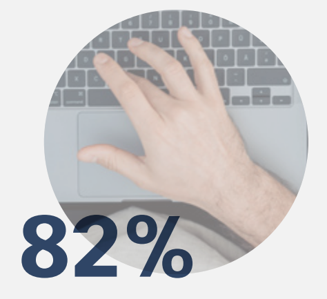
of breaches involved the human element

One factor that increases cyber risk is a reliance on traditional security tools and infrastructures — siloed data and signals, manual vulnerability management tools, and antiquated access management solutions. These outdated approaches saddle organizations with a reactive security posture, leaving them to try to manage blows as they're dealt. This passive approach is a costly one, resulting in damage that can far exceed the direct cost of today's average breach. According to Cisco's 2022 Security Outcomes Report, Volume 3: Achieving Security Resilience, 40% of information security and privacy professionals around the globe reported that their organizations are grappling with lasting brand damage in the wake of a past security event.